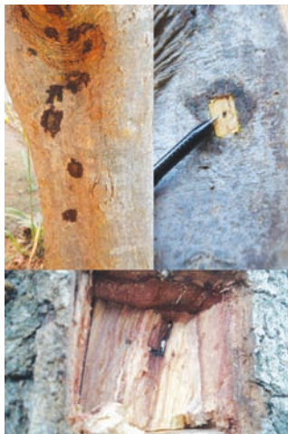
Typical signs of infestation by PSHB

To read more about the invasive beetle, visit https://bit.ly/2SfuySw . Further information is also available at www.fabinet.up.ac.za/index.php/research/7